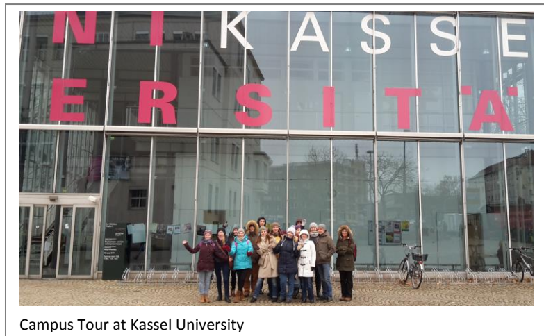
Campus Tour at Kassel University

University who reported on their experiences and joined the general discussion to answer specific questions of the Russian guests.