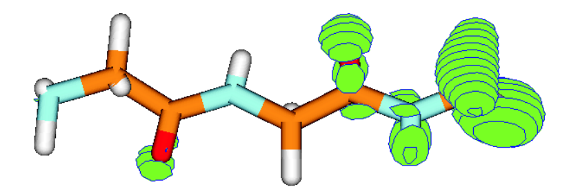
Hole density at t = 0

Exposing molecules to ultrashort laser pulses can trigger pure electron dynamics in the excited or ionized system. The positive charge created upon ionization of a molecule can migrate throughout the system on a few-femtosecond time scale solely driven by the electron correlation and electron relaxation. Charge migration triggered by ionization appeared to be a rich phenomenon with many facets that are rather characteristic of the molecule studied. Results from ab initio calculations on different systems will be presented and the mechanisms underlying the charge migration will be analyzed in terms of simple models. The importance of the phenomenon and the possibilities for its experimental verification will also be discussed. Due to the coupling between the electronic and the nuclear motion, the control over the pure electron dynamics offers the extremely interesting possibility to steer the succeeding chemical reactivity by predetermining the reaction outcome at a very early stage. A way to control the charge migration by appropriately tailored femtosecond laser pulses will be presented and the consequences of the application of such a scheme will be discussed.