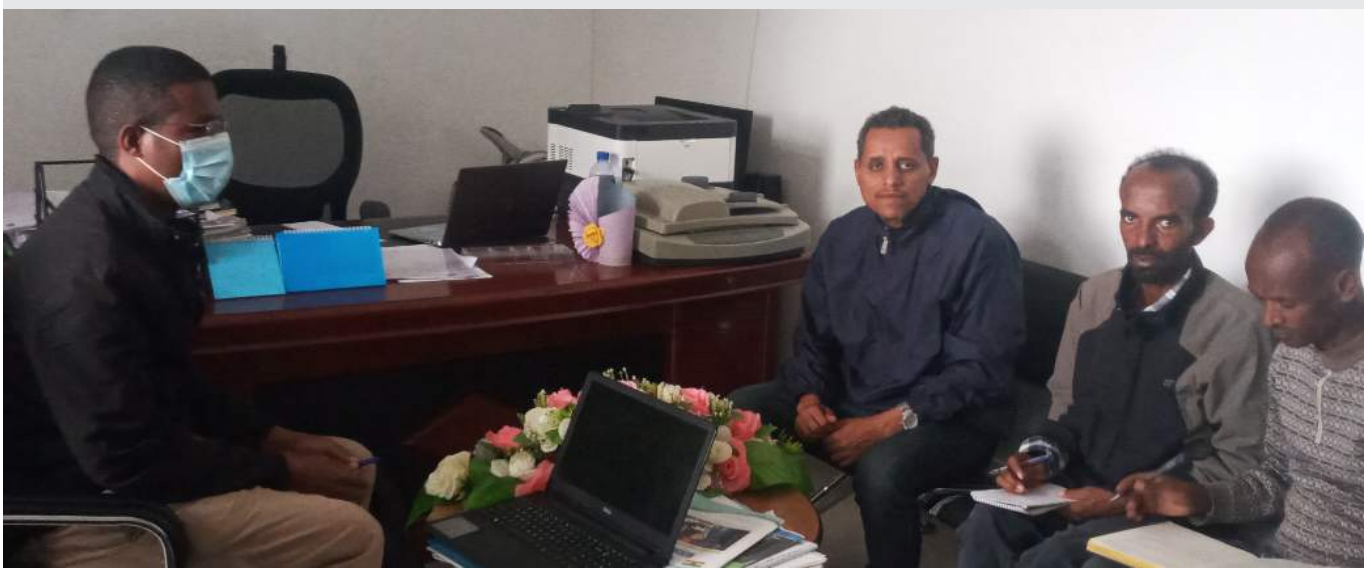
Mekelle city administration transport experts