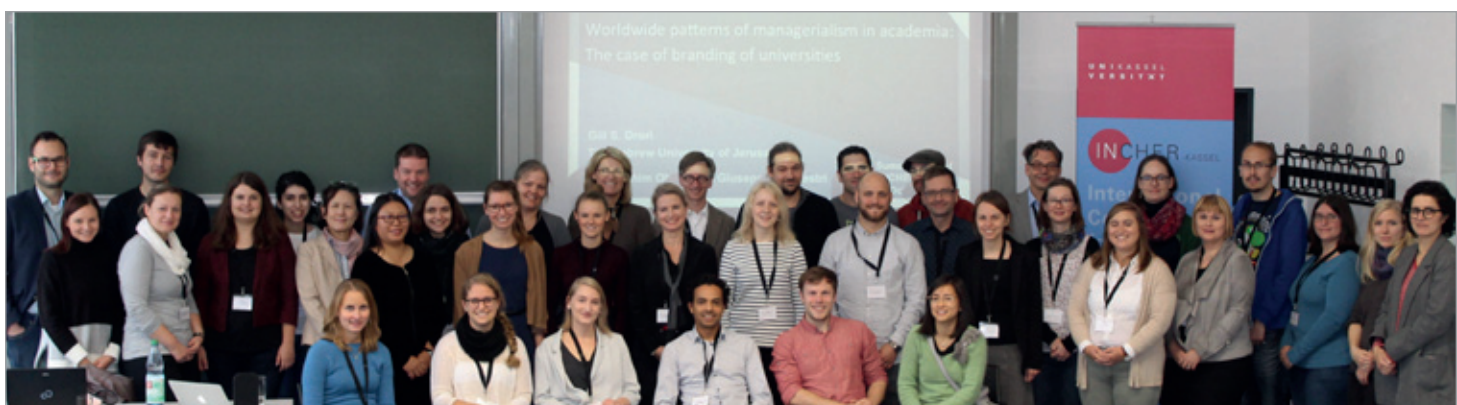
Organizers, participants and speakers at the 2017 summer school "Boundaries in Science and Higher Education"

Last year's "Summer School in Higher Education Research and Science Studies" was organized by INCHER-Kassel. It took place from the 9th - 13th October 2017 at the University of Kassel. Twenty-five graduates and 12 junior researchers took part in the Kassel summer school.