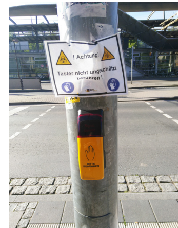
Jena, Germany, 2020

This sign illustrates the ambiguity of the measures taken by cities in Germany to protect their inhabitants from the unknown (virus).