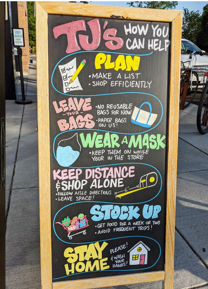
Supermarket panic-buying during the COVID-19 pandemic